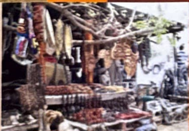
Craft Market - Zambia