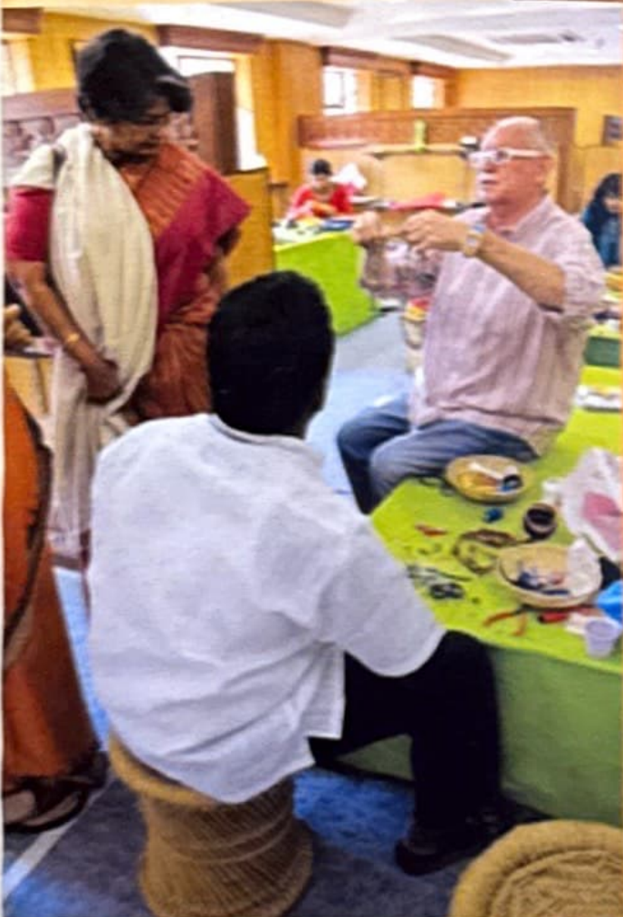
Abhushan Fibre workshop