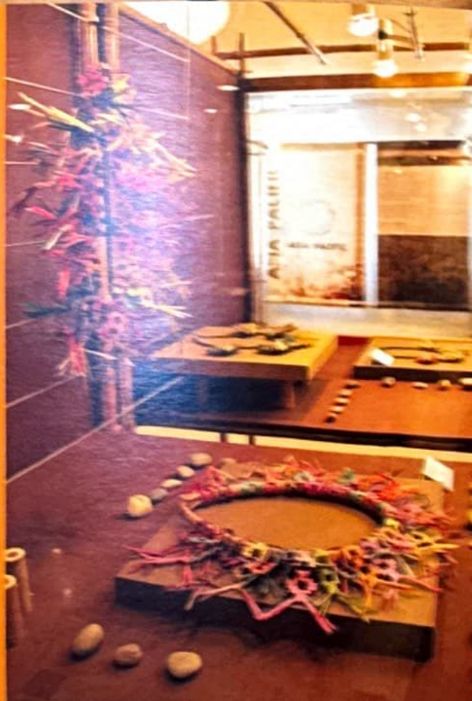
Abhushan Curated Exh