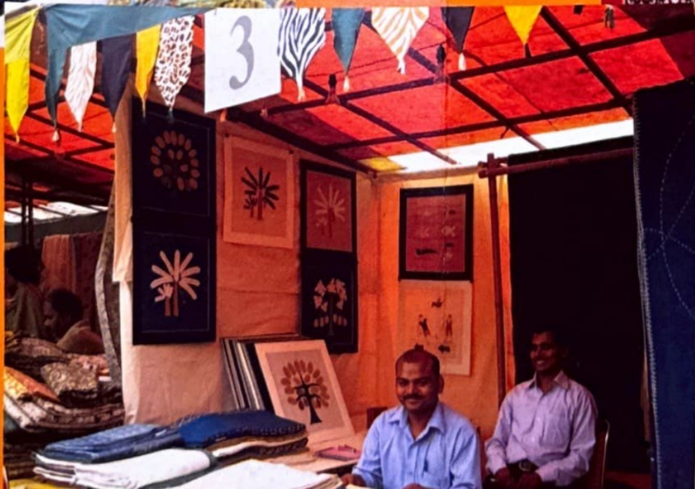
DCC's Malkha Design Collection